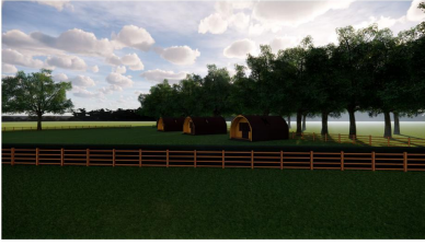
3D View 2 1:1