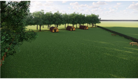
3D View 4 1:1

NOTES Do not scale from this drawing. Only figured dimensions are to be taken from this drawing. The contractor must verify all dimensions on site before commencing any work or shop drawings. The contractor must report any discrepancies to the designer before commencing work. If this drawing exceeds the capabilities taken in any way, the designer is to be informed before the work is initiated. Work within The Construction (Design and Management) Regulations 1994 is not to start until a Health and Safety Plan has been produced.