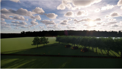
3D View 3 1:1